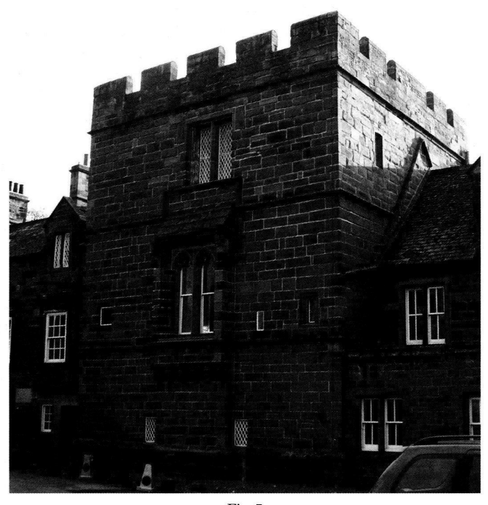
Fig. 7 The Prior's House, Carlisle, Cumbria