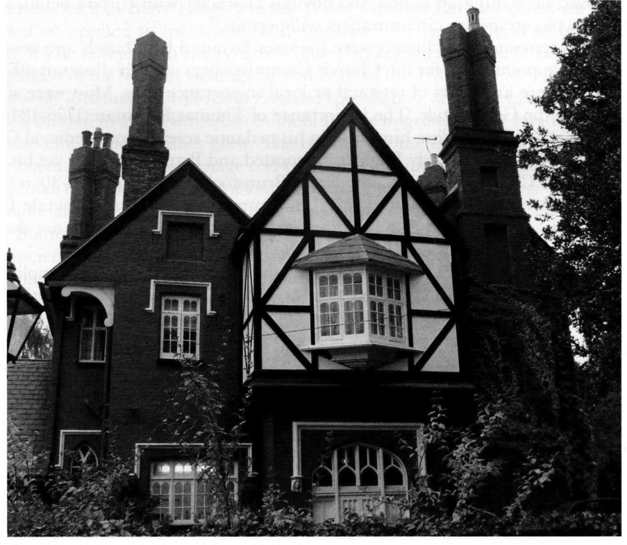
Fig. 12 The Rectory, Louth, Lincolnshire

By the 1830s, Tudor Gothic, with its prominent gables, decorative barge boards, projecting porches, mullioned and transomed windows, hood moulds and tall chimney stacks, was the most popular parsonage style. C.J. Carter's (1784-1851) rectory at Louth, Lincolnshire (1832) represents the process of transformation between styles, with its patchwork of features (Fig. 12). The garden elevation is a symmetrical Tudor Gothic, but the front turns picturesque, looking uneasily forward to the mature Victorian parsonage, while retaining some elements of the cottage orné . Charles Kirk's rectory at Swaton, Lincolnshire, is still Tudor Gothic in 1844 (Fig. 13).