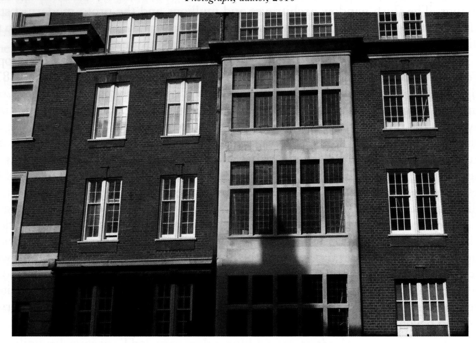
Fig. 20 Flush mullions at the former Middlesex Hospital, Mortimer Street, London (1912, Nassau Street elevation)