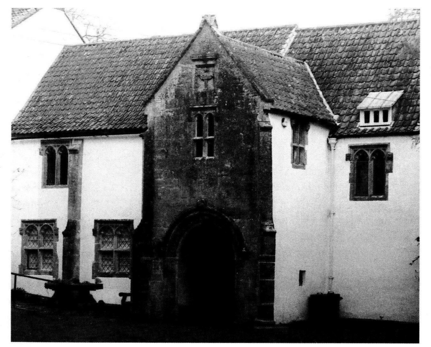
Fig. 3 (above) The Old Vicarage, Methwold, Norfolk, (gouache and watercolour, artist unknown) Collection of the author; photograph, author, 2013

Fig. 4 (left) The Priest's House, Congresbury, Somerset Photograph, author, 2008