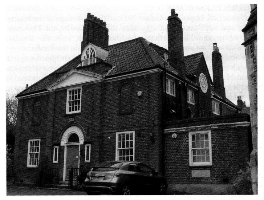
Fig. 21 Former vicarage, St.James, Muswell Hill, London Photograph, author, 2014