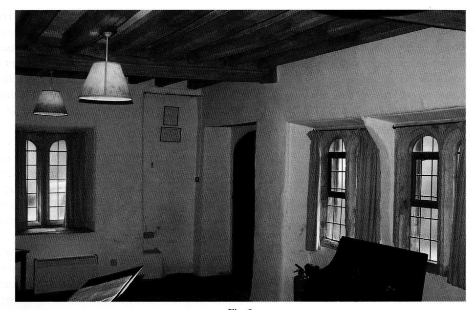
Fig. 5 The Priest's House, Easton on the Hill, Northamptonshire, interior Photograph, author, 2008