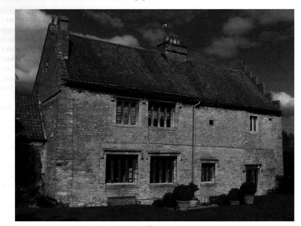
Fig. 6 Great Ponton Hall, Lincolnshire Photograph, author, 2010