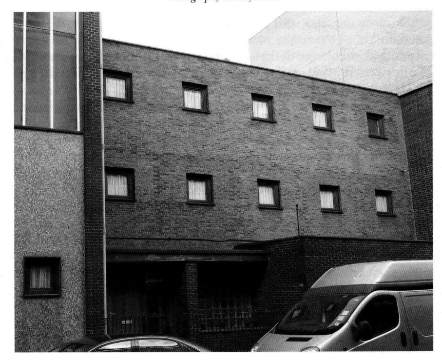
Fig. 22 The manse, St.Boniface (R. C.) Adler Street, London (1960) Photograph, author, 2015