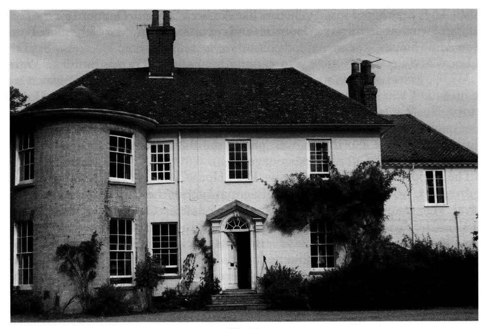
Fig. 10 Marlesford Rectory, Suffolk Photograph, author, 2013