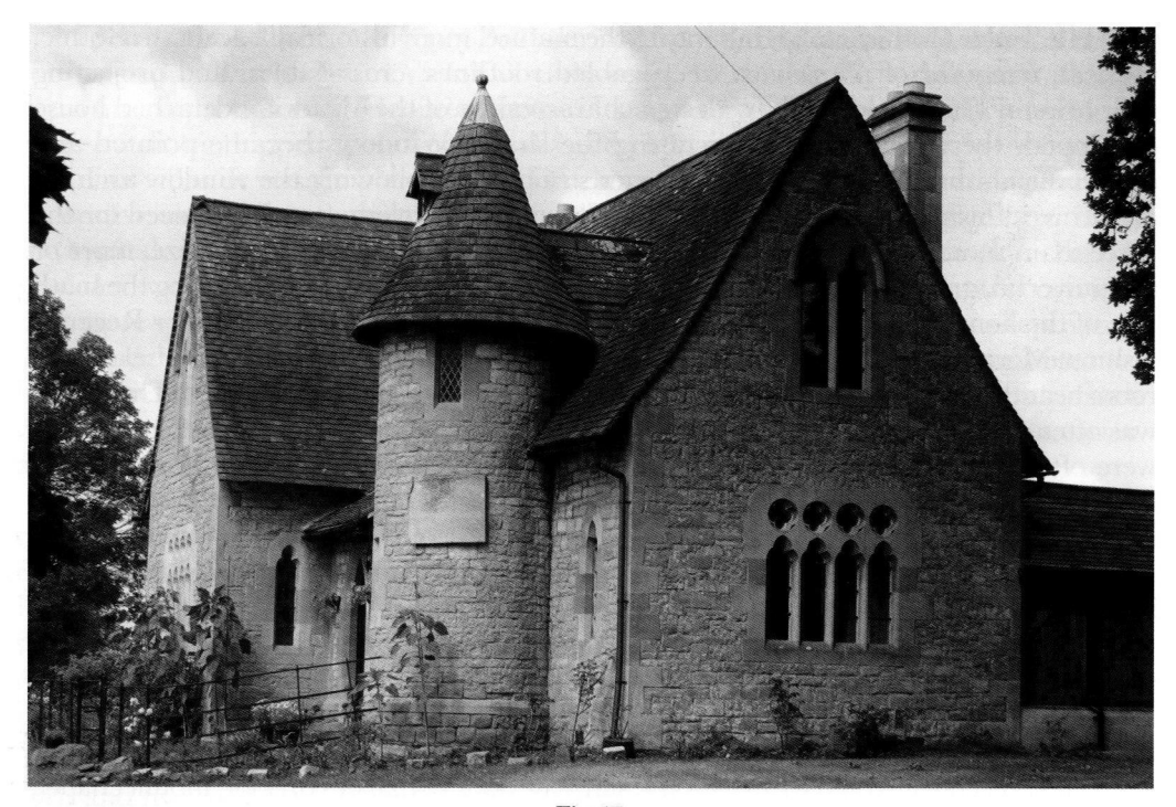
Fig. 15 The Sexton's Lodge, Highnam, Gloucestershire