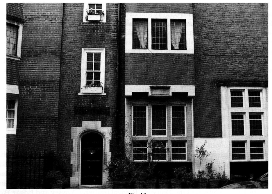
Fig. 19 Flush mullions at York House, Candover Street, London, by H. Fuller Clark (1903) 2010