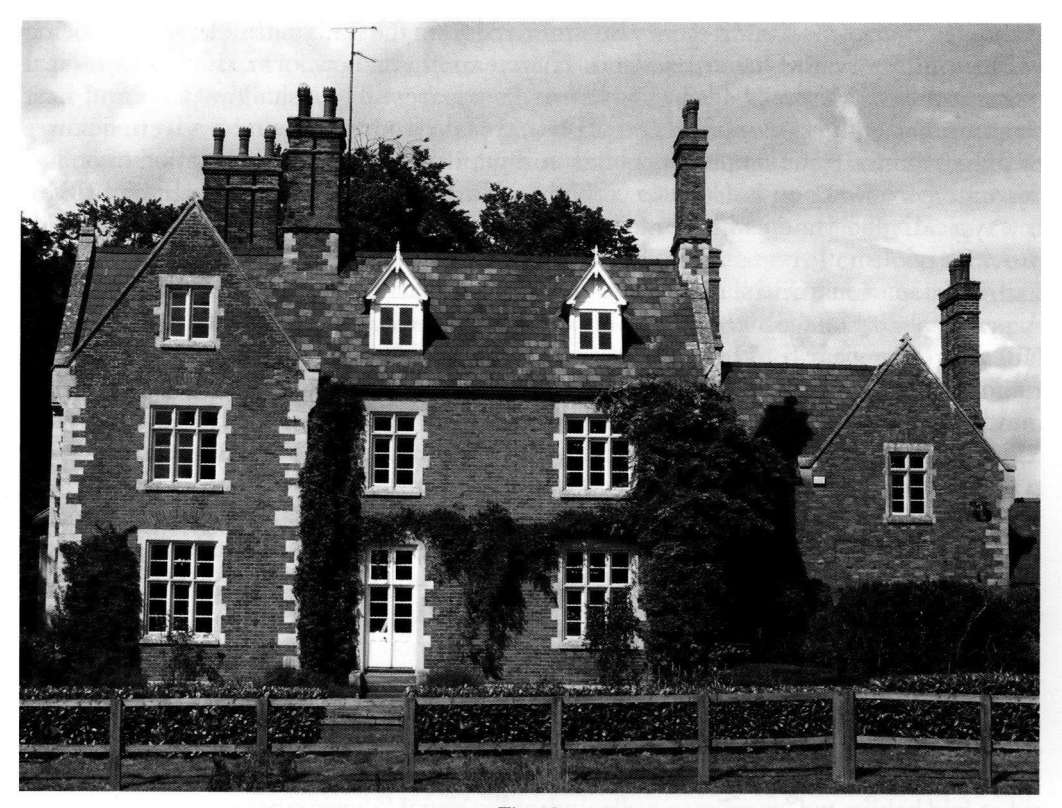
Fig. 13 The former rectory, Swaton, Lincolnshire Photograph, Smiths Gore, 2007