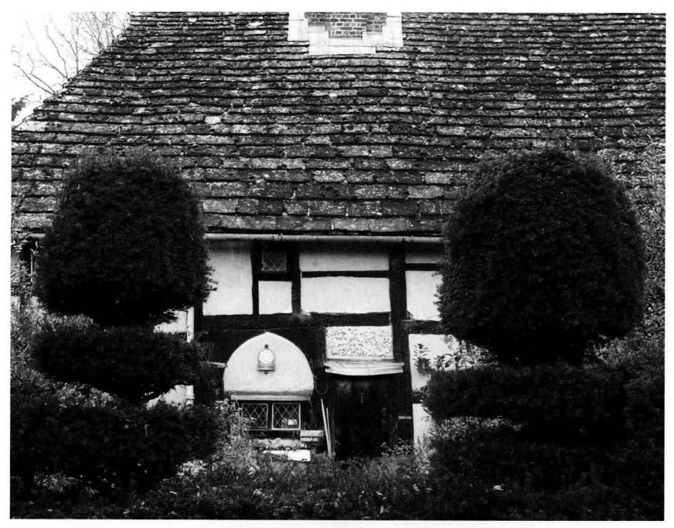
Fig. 1 The Priest House, West Hoathly, Sussex Photograph, author, 2010