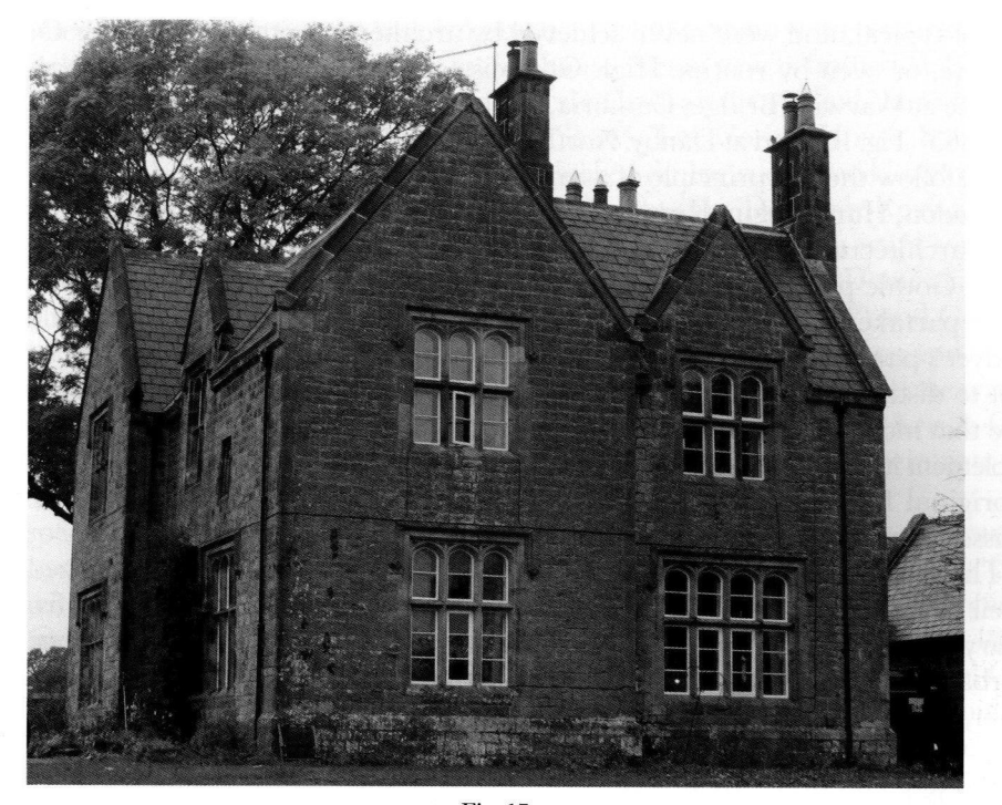
Fig. 17 Danby Vicarage, Yorkshire