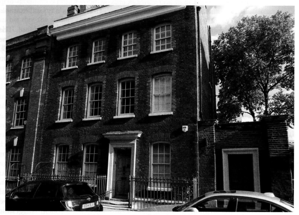
Fig. 9 Christ Church Rectory, Spitalfields, London 2015