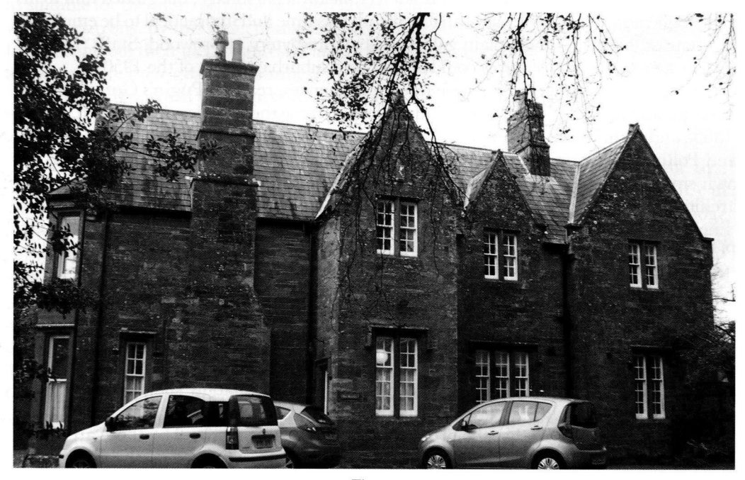
Fig. 16 The Rectory, Warwick Bridge, Cumbria Photograph, author, 2011