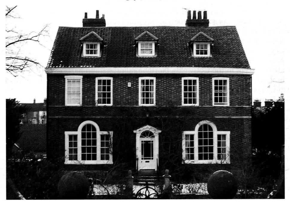
Fig. 11 St. Wulfram's Vicarage, Grantham, Lincolnshire Photograph, author, 2010